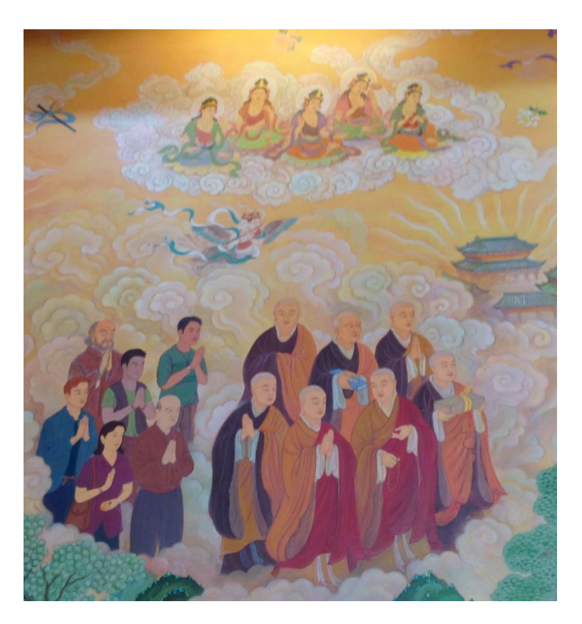
5pm, 4 May (Thursday), 2023 Room LG17, Faculty of Law (Sidgwick Site)

Preservation of the Past while Engaging with the Future