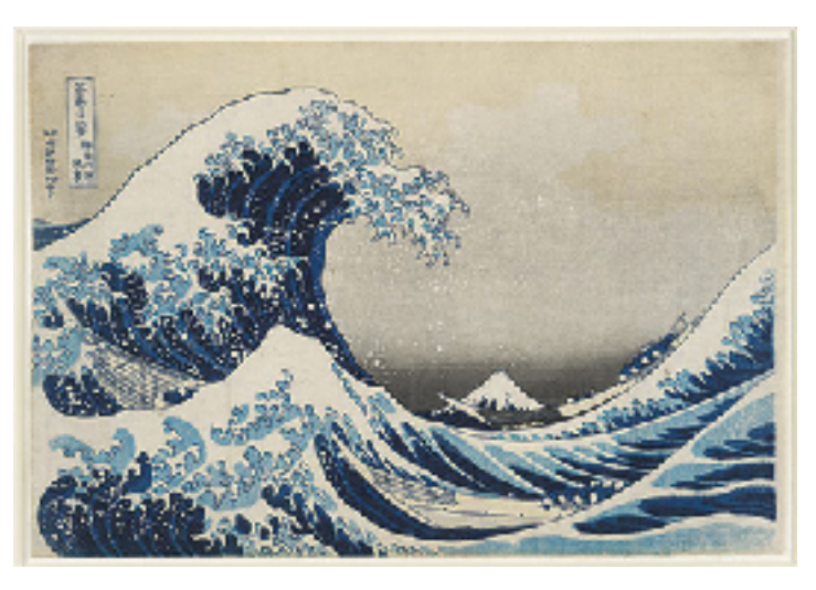
Ukiyoe by Hokusai