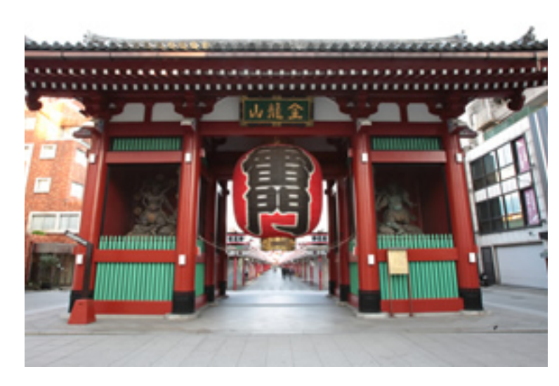
Sensōji, Asakusa Kannon Temple