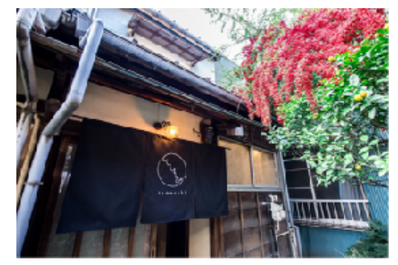
The place you stay at