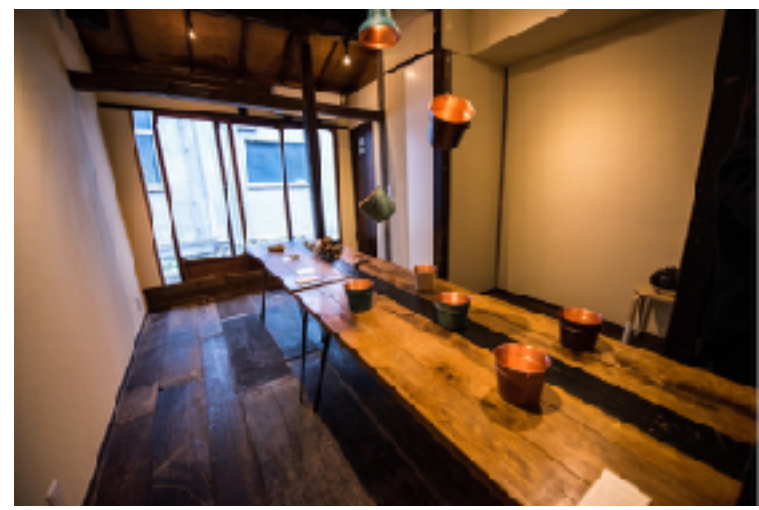
Inside of your stay