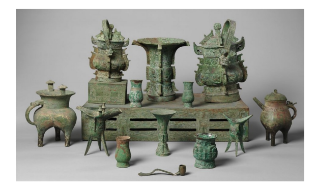
Fig. 1: Archaic bronze altar set, late 11th century BCE, Shang dynasty–Western Zhou dynasty (1046 –771 B.C.), Metropolitan Museum of Art, New York

Not long after submitting my PhD dissertation, I was asked by someone how long it was. Although somewhat perplexed by the question (does length matter over substance?), I told the person that it was over 300 pages. The comment that followed was even more baffling, 'but it has a lot of pictures doesn't it?'